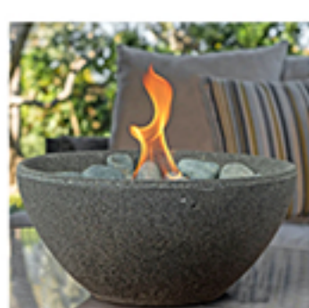
Table Top Fire Bowl

Bring on the ambience with inexpensive fire bowls